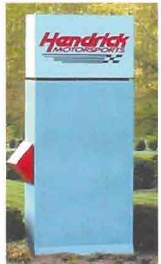
More than 700 engines are built each year at the Hendrick Motorsports complex, located near Lowe's Motor Speedway in Charlotte, NC.