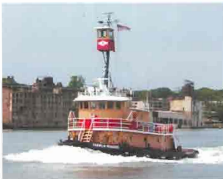
Reinauer Maritime Group operates out of Staten Island, N.Y., and East Boston, Mass.